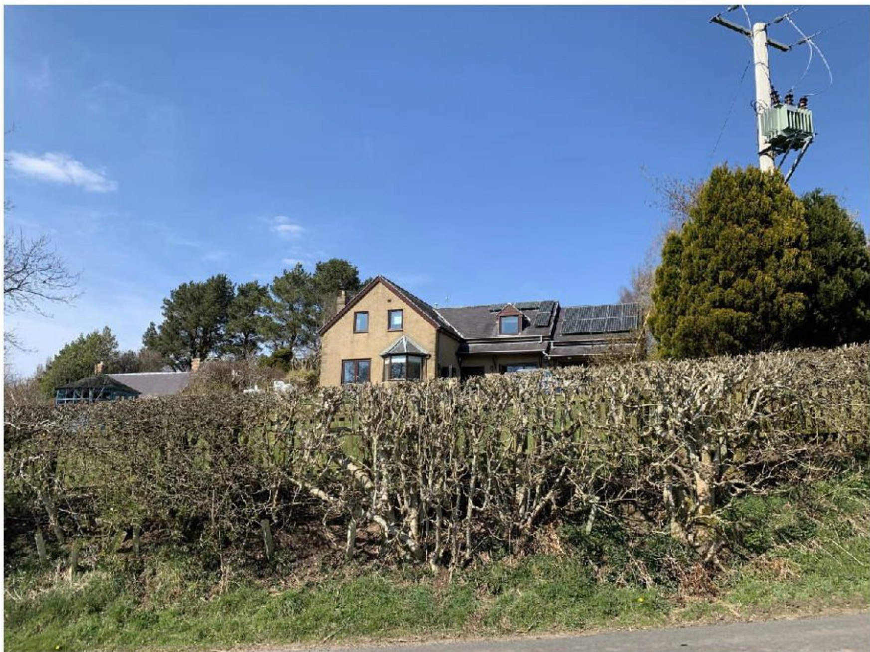
Souden View (Roof of Whinfield Cottage visible to left)