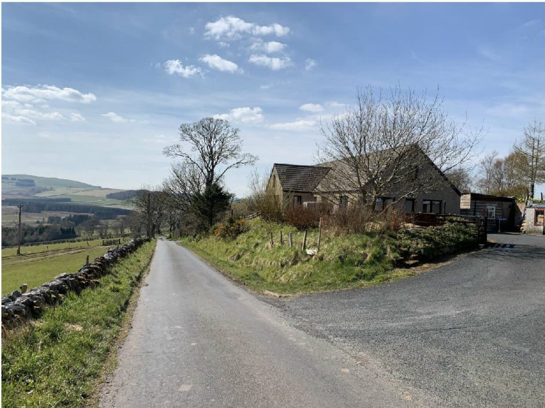
October House (Looking West)