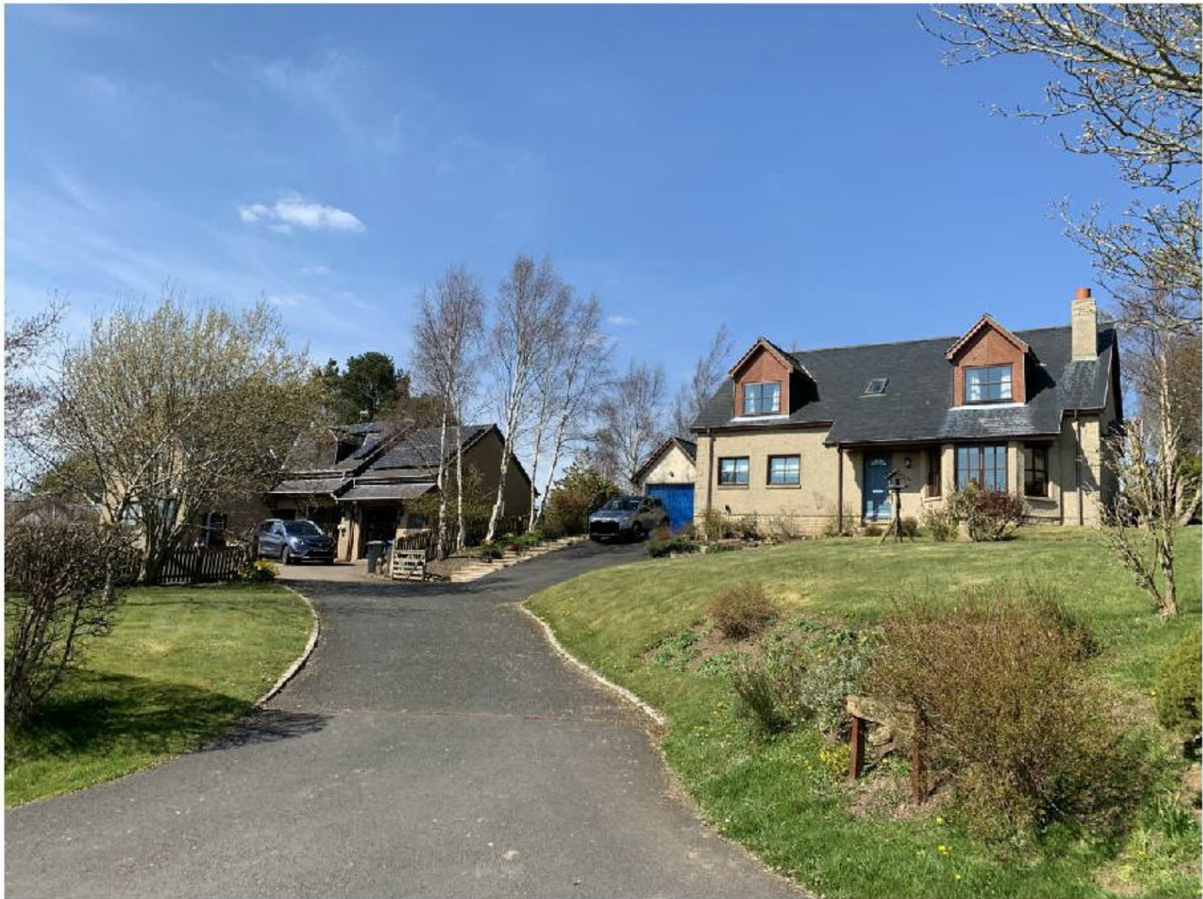
Souden View & River View