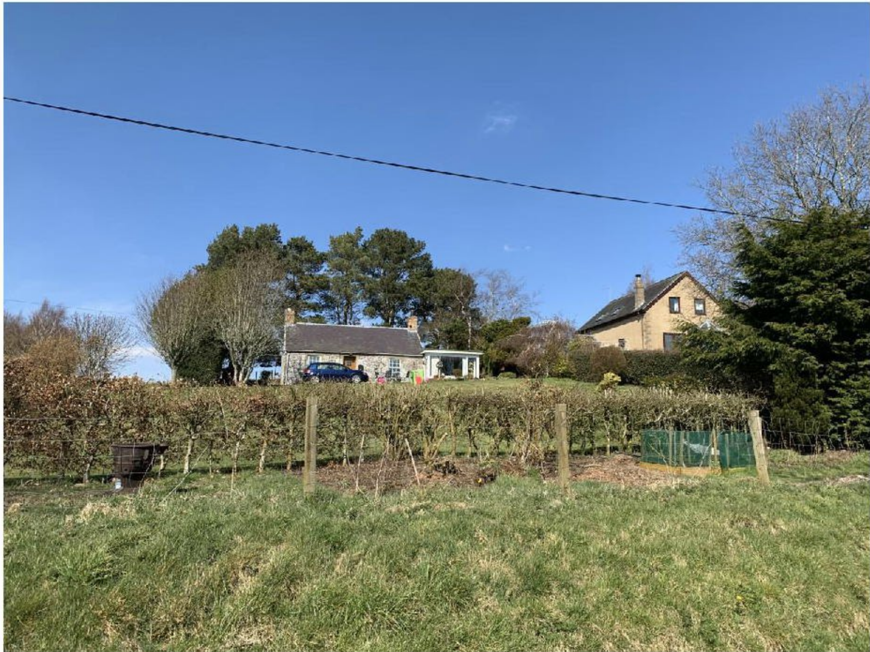
Whinfield Cottage & Souden View